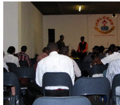
French church in Pretoria