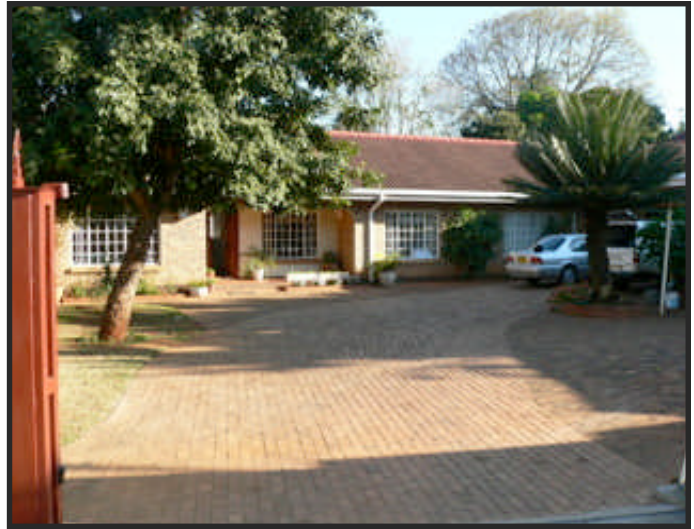
The Avery's new home in Tzaneen

The move puts us 4 hours closer to all our various ministries, living in a safer area, getting out of the crush of Joburg and in a less expensive place to live. It is a blessing to be living in a small town environment. The friendliness of people is markedly better.