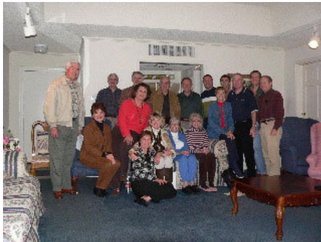
Most of the AOM Board Members at the Annual Retreat