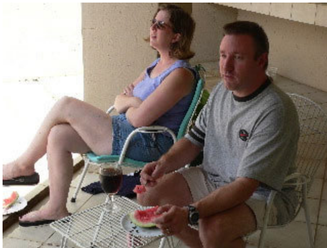
Watermelon Season = Christmas Time